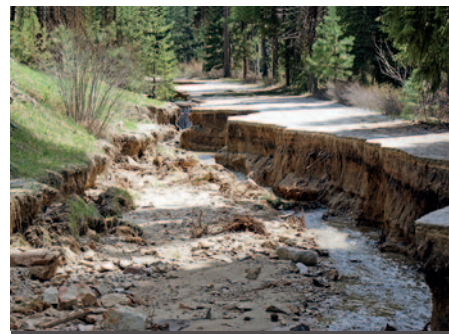
PROBLEMS Above: Water from beaver dams can flood and even wash out roads. Below: The structures can also block bull trout and Arctic grayling seasonal movements and increase siltation upstream that can smother spawning gravel.

Historically, if a beaver dam blocked or silted in one spawning tributary, salmonids could still reproduce in countless others. Not anymore. Habitat loss and warming temperatures have shrunk Montana’s bull trout population to a small percentage of former numbers. Grayling loss is even greater.