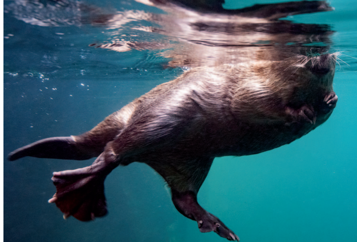
UNDERWATER WONDER Though slow and clumsy on land, beavers are swift, agile swimmers. The rodents are aided by powerful webbed feet; a broad, rudderlike tail; transparent eyelids; and an extra set of lips behind their teeth so they can chew and carry branches beneath the surface without drowning. A challenge for FWP biologists and land managers is returning these marvelous mammals to areas where they do more good than harm.

FWP and conservation groups are looking for more streams where improvements could encourage beavers to move in. Trapping beavers from one area and moving them to potential sites can work, but only under ideal conditions. “If the habitat isn’t