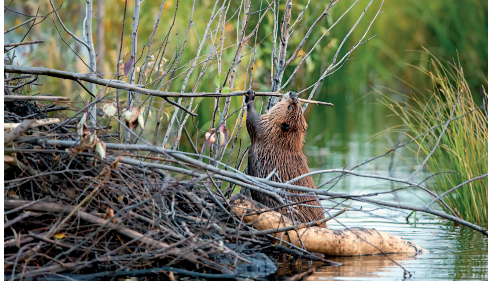
STICK-AND-MUD CITADEL A beaver constructs a lodge in western Montana. A fortress of sticks and mud, the structures have a dry chamber inside above the water line. Accessible only by underwater tunnels, lodges allow beavers to sleep and raise their young safe from predators.

At the Spotted Dog swamp, Ritter says that beavers historically created a similar wetland complex but on a far grander scale. He points to decades-old gnawed sticks jutting out from a deep-cut bank. Beavers were removed in the mid-20th century, probably to keep the meadow from flooding. Without dams to slow its flow, Spotted Dog raced downstream “like an irrigation ditch, gushing like a fire hose,” Ritter says. Instead of naturally overflowing its