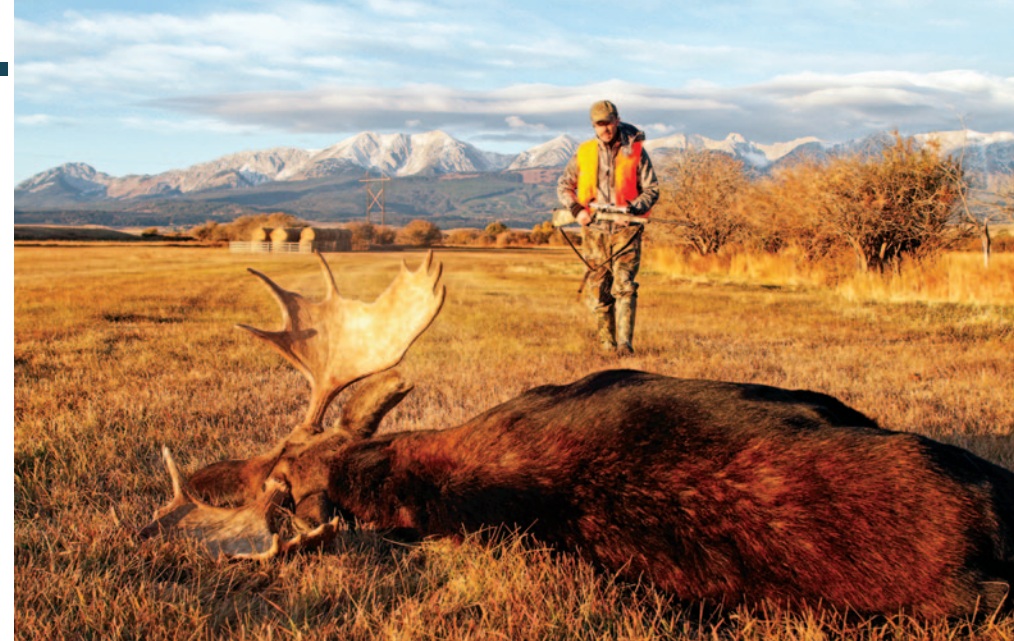
HOW RESEARCH PAYS OFF Biologists hope the 10-year moose population ecology study will provide information to help them offer as many hunt-of-a-lifetime opportunities as possible while ensuring that populations are not overharvested and remain healthy.

Over the next few years, researchers will keep monitoring the collared moose and their young. They’ll also continue studying the genetics of Montana’s Shiras moose to